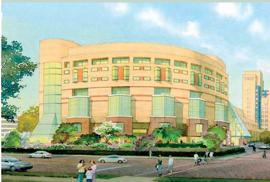
Rendering of the new Cancer Hospital

The new cancer hospital will feature designated spaces for specific patient populations, including those undergoing treatment for breast cancer, skin cancer, lung/esophageal cancers and many other conditions.