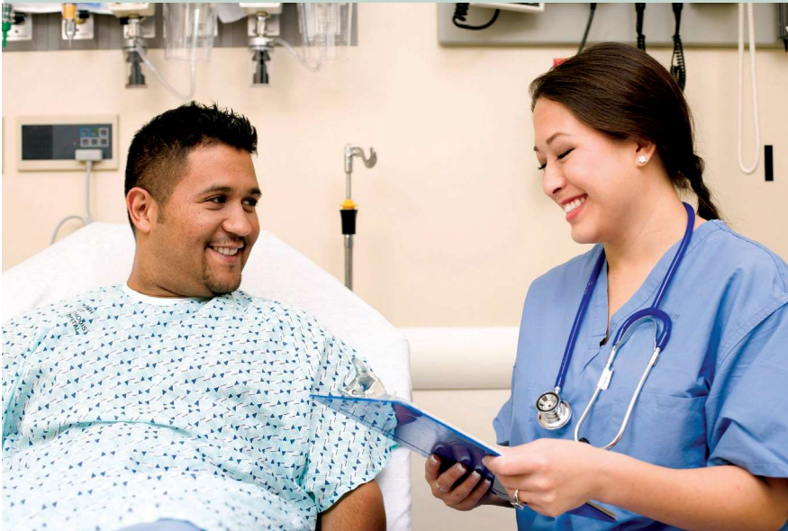
[ The needs of tomorrow demand our best effort today. ]

We're proud to be among the nation's top 20 cancer centers, but the fact remains we've achieved that distinction with more modest resources than our peer institutions.