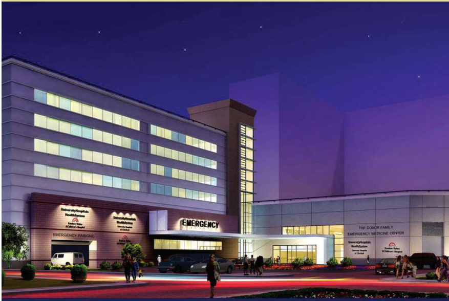
Rendering of the new Emergency Department

The Emergency Department at UH is a key gateway to health for thousands of patients in our community: